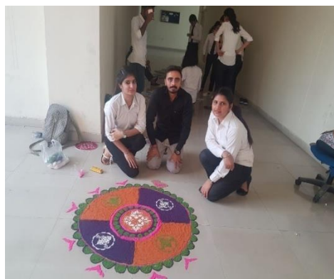
Rangoli Competition on 31 st October, 2017 by Department of Management Studies