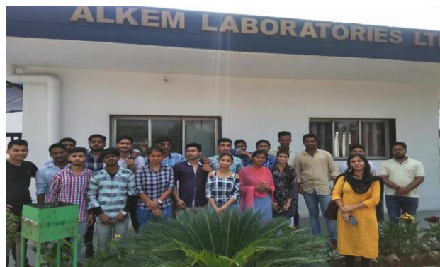
Industrial Visit to Alkem Laboratories Ltd. on 7 th September, 2017 by B. Pharmacy 3 rd Sem students to know about tablet packing and manufacturing and injection packing