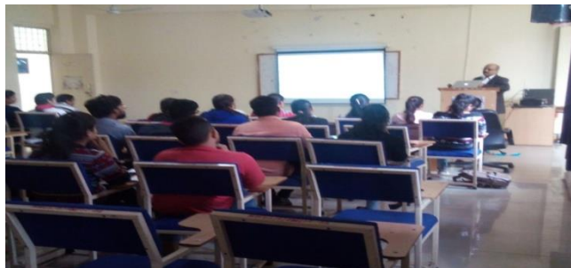
Guest Lecture on different techniques of analysis