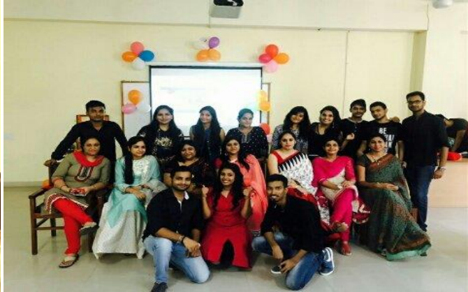
More Glimpses of Extra-Curricular Activities