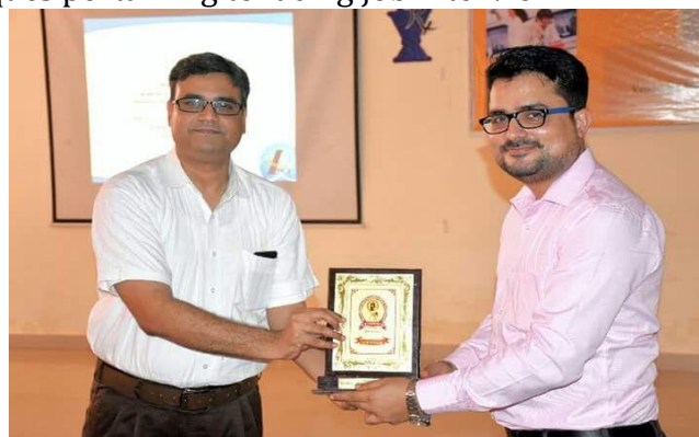
Training Session on Health Insurance on 6 th October, 2017 by Department of Management Studies