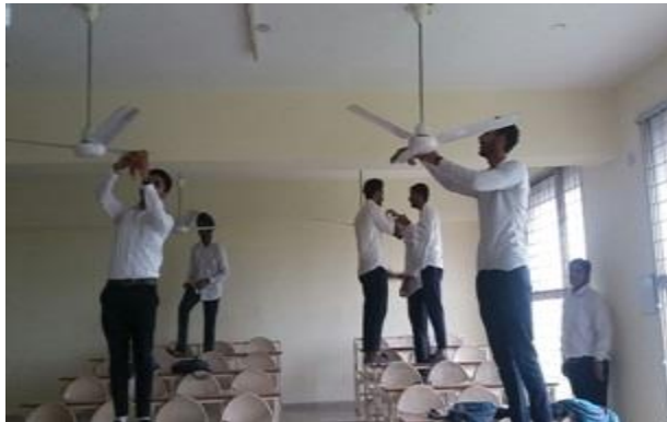
Swachh Bharat Abhiyan on 22 nd September, 2017 by Department of Management Studies