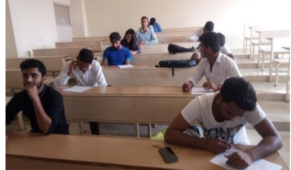
Technical Quiz on 27 th September, 2017 by Excelsior Club, CE department