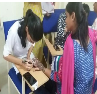
Mehandi Competition on 7 th October, 2017 by Department of Management Studies