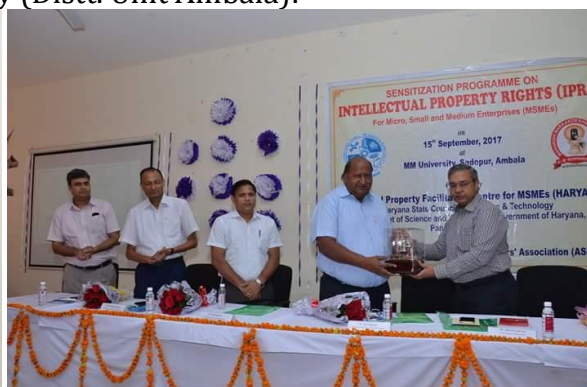
Sensitization Programme on Intellectual Property Rights & Patents