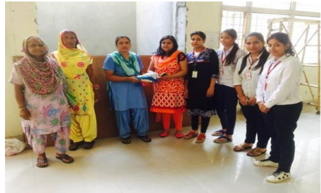
Cloth Donation on 23 rd August, 2017 by Burning Comet Club of CSE department to underprivileged people