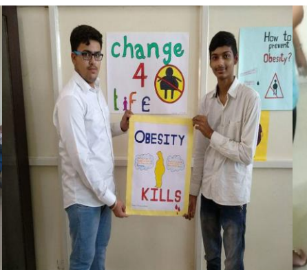
World Obesity Day Celebration on 11 th October, 2017 by MM School of Pharmacy