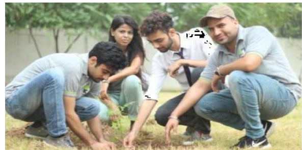
Tree Plantation Drive

MM School of Architecture organized a “ Tree Plantation Drive ” in university on 27 th July, 2017 in collaboration with Department of Forests, Ambala to spread message Grow Trees & Save Environment. Bearing in mind the consequences of escalating global warming, saplings of various trees were planted.