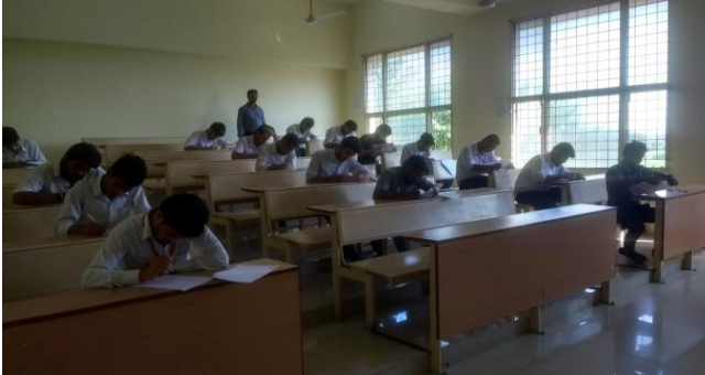
Quiz Competition: Engineeria on 12 th September, 2017 by department of ME in association with CADD Centre, Ambala