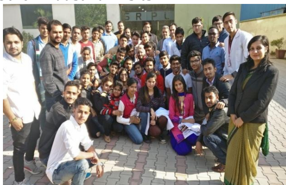
Industrial Visit to Systole Remedies Pvt. Ltd on 24 th November, 2017 by B.Pharmacy 1 st Sem students to view operational mechanisms of equipments like HPLC, Muffle Furnace, UV Spectrophotometer, FTIR etc.