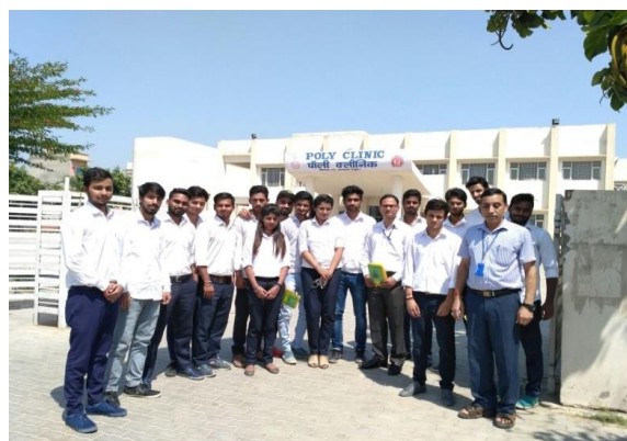
Industrial Visit to Polyclinic, Ambala

As a part of social awareness campaign, students of CE Department were taken to “Polyclinic”, Sector-10 Ambala, on 10 th September, 2017 where doctors briefed them on causes and preventions of water borne diseases. The drive was focussed on adopting measures that can lead to a healthy lifestyle by creating and spreading awareness about the diseases that occur via consumption of water.