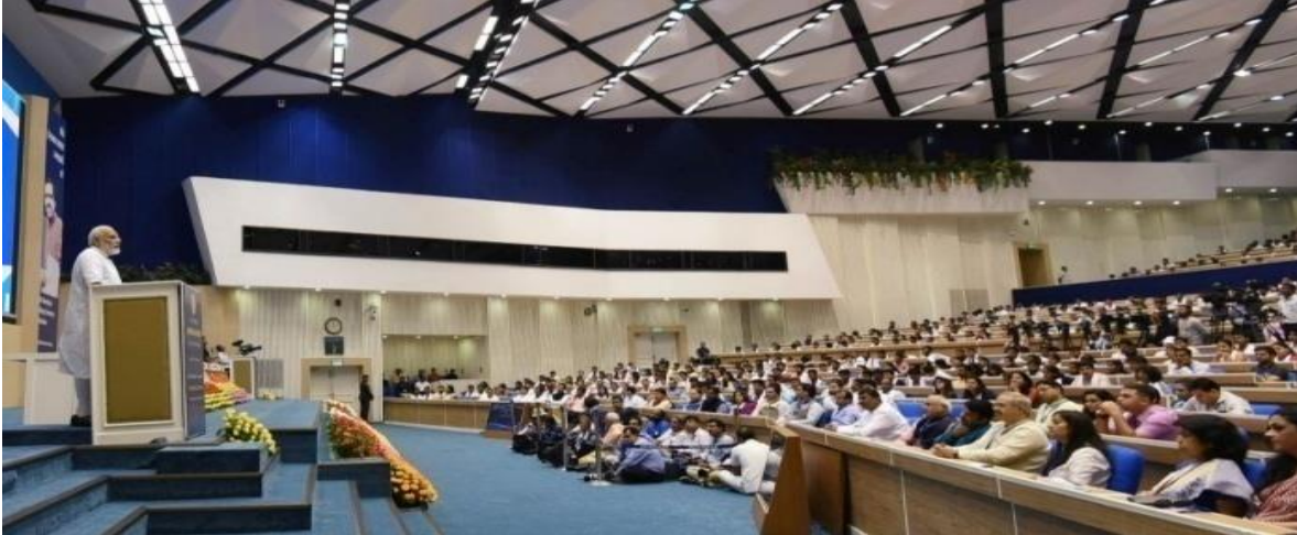
Live Telecast of Hon'ble PM Modi's address to students

Prime Minister Narendra Modi addressed students across the nation on 11 th September, 2017 from Vigyan Bhawan, New Delhi via Live Telecast to mark the centenary celebration of Pandit Deendayal Upadhyaya and 125 years of Swami Vivekananda's address at the Chicago World Parliament of Religions, U.S.A. The theme of the address was Young India New India - A Resurgent Nation: From Sankalp to Siddhi . Students from various departments attended the address.