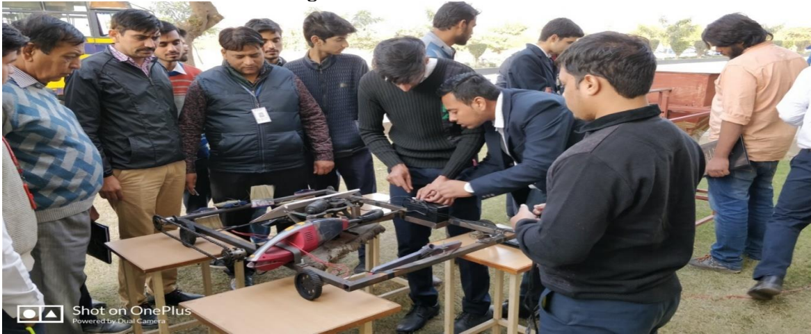
Technical Project Exhibition and Competition

The department of ME organized a “ Technical Project Exhibition cum Competition ” on 24 th November, 2017 for final year students as a part of their training/project work. Two best projects, namely, Brush Cutter and Automatic Floor Cleaner were declared as best projects on the basis of practical implementation, design and safety parameters by an expert committee of Mechanical Engineers.