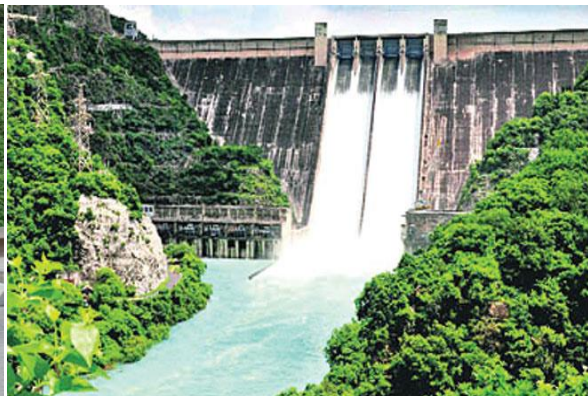
Industrial Visit to Bhakra Dam and Virasat-e-Khalsa